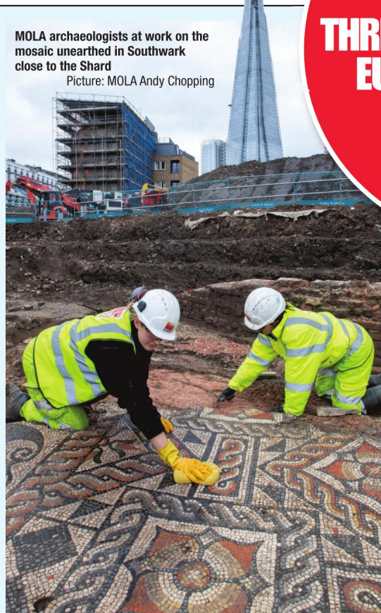
MOLA archaeologists at work on the mosaic unearthed in Southwark close to the Shard