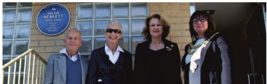
The plaque unveiling in Vardans Road, Clapham, where plane-making Omnia Works was.