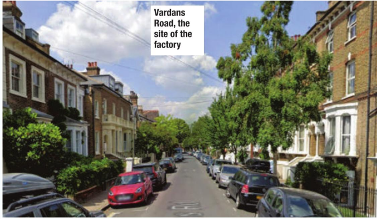
Vardans Road, the site of the factory

Hilda Hewlett, the first woman in Britain to earn a pilot's licence and the first to set up an aircraft factory, was dismissive of her achievements.