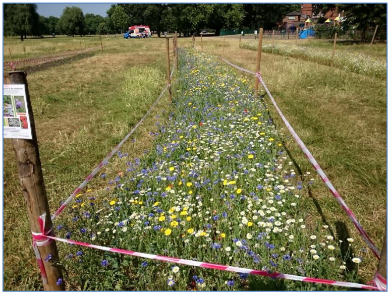
Figure 3: Area of wildflower seeding