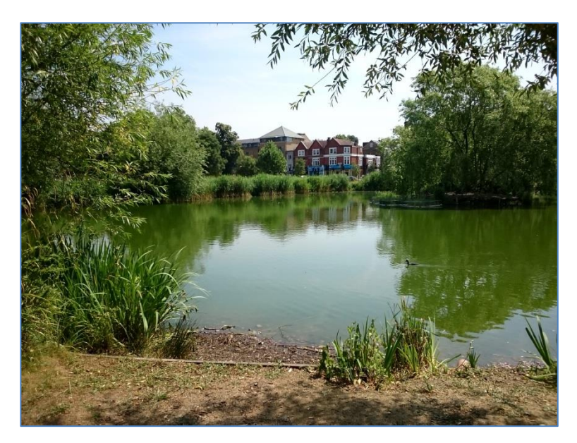
Figure 1: Eagle Pond