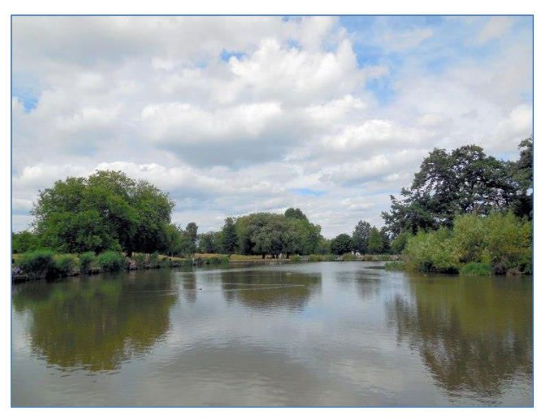
Figure 4: Mount Pond