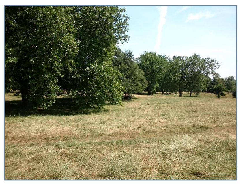
Figure 6: Parkland with scattered trees