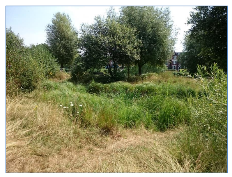
Figure 2: Small pond and associated vegetation