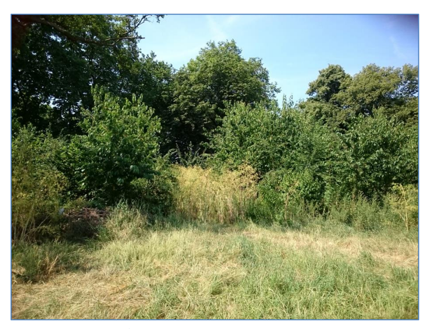
Figure 5: Nursery Wood